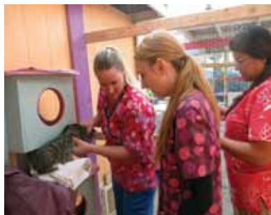
PCC students (not interns) taking temperature, pulse, and respiratory readings at The Hermitage.

I n the previous issue of the Tabby Tabloid we talked about the benefits of having an internship on your résumé. We already know that employers look for real experience when considering a job candidate, and having that